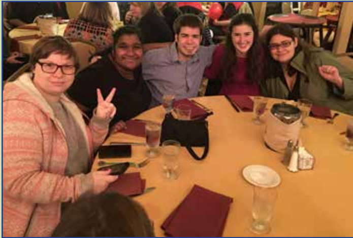
College Experience students enjoy the festivities at the 2016 Holiday Party, held at Mallozzi's Banquet and Ballrooms in Rotterdam in December.