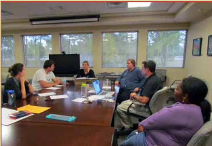
Making Plans: Members of the Ability Nation Self-Advocacy group at their September, 2016 meeting, where they planned the Bingo Fundraiser, held in October.

Attending the conference will allow members to share ideas and strategies with other self-advocates from all over the state, to hear keynote speakers, and attend workshops and focus groups.