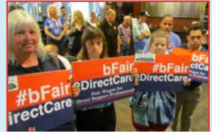
Living Resources employees and program participants demonstrating in favor of state funding for wage increases at Proctors Arcade in Schenectady last summer.

To learn more about how you can become involved with upcoming #bFair2DirectCare events, visit their Facebook page.